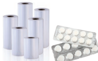
Film & Thermal-Forming