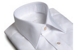
Hot-Melt Adhesive Coating